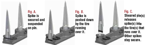
Fig. A. Spike is secured and suspended on pin.

The pins hold the suspended spikes firmly in place releasing only those spikes that are run over preventing loss of additional spikes from the system. The Ultimate MagnumSpike! is the only answer to 21st century tire technology.