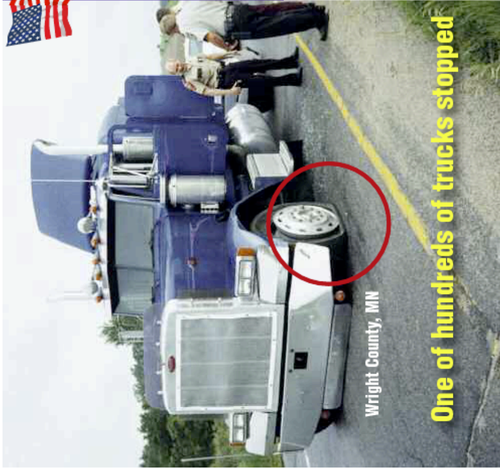
Wright County, MN