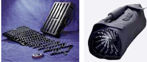
Polymer Hard Case in 10' and 25' deployable lengths Soft Ballistic Nylon Case Wrap & Roll in 12' and 16' deployable lengths

Convenient Deployable Lengths in Both Polymer Hard Case or Ballistic Nylon Soft Case (Wrap & Roll)