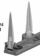
Fig. B. Spike is pushed down by the tire running over it.