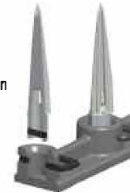
Fig. C. Sheared pin(s) releases spike(s) into the tire(s) that runs over it. Other spikes stay secure.