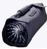
Soft Ballistic Nylon Case Wrap & Roll in 12' and 16' deployable lengths

There's no need to buy different size units to stop different size vehicles. Both the MS and the UMS models are offered in various deployed lengths to meet the different requirements of Law Enforcement Agencies and the Department of Defense.