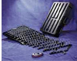
Polymer Hard Case in 10' and 25' deployable lengths

Convenient Deployable Lengths in Both Polymer Hard Case or Ballistic Nylon Soft Case (Wrap & Roll)